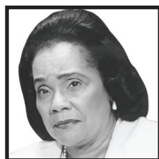
Coretta Scott King